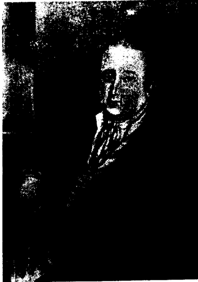
2 Leonard Harbaugh (1749 — 1822)