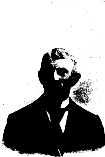
4 Ephraim Frederik Harbaugh (1831 — 1916)