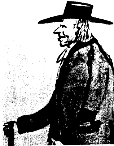
1 Jost Herbag/Herbach (1741 — 1830)